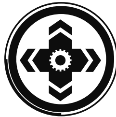
EQUIPPED TO SERVE