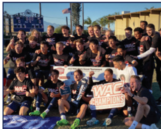
WAC Tournament Champions 1st NCAA Tournament Appearance