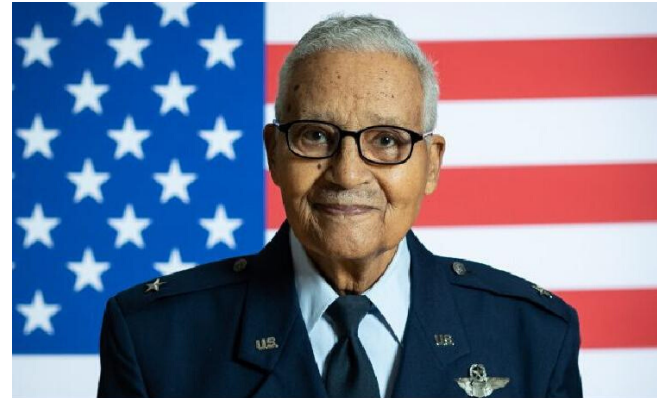
BRIGADIER GENERAL CHARLES MCGEE COMBAT PILOT, TUSKEGEE AIRMAN

GUEST SPEAKER MARCH 25, 2020 1:00 PM - 2:00 PM INNOVATORS AUDITORIUM