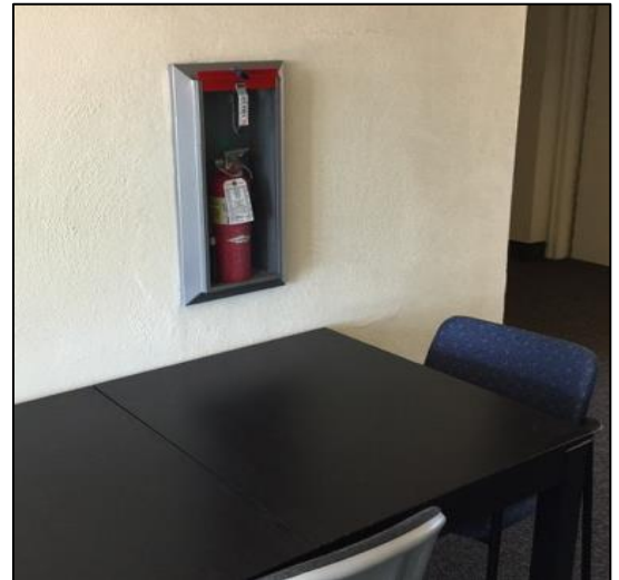
Photograph 1 – Blocked Fire Extinguisher

If an area identified with a fire extinguisher cabinet, sign, or mount is discovered without a fire extinguisher or if a fire extinguisher is discovered placed on the ground immediately contact the Environmental Health and Safety Coordinator or Facilities & Planning Services .